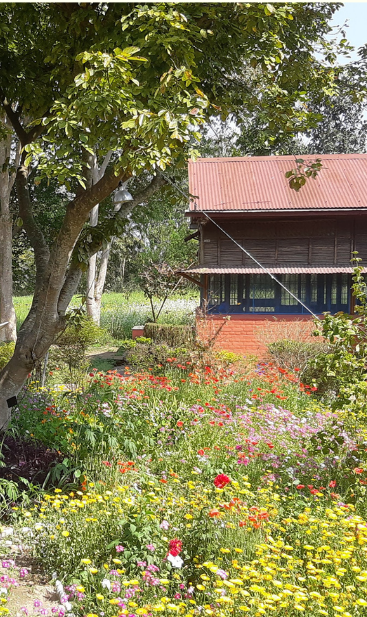
Navdanya Earth University, Biodiversity Conservation Farm Ramgarhd, Uttrakhand