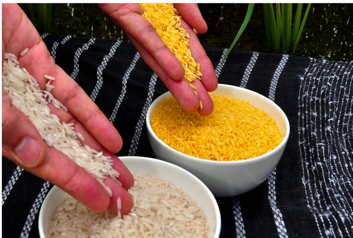
"Golden Rice grain compared to white rice grain in screenhouse of Golden Rice plants", by International Rice Research Institute (IRRI) is licensed under CC BY 2.0 ( https://creativecommons.org/licenses/by/2.0/ ).

IRRI, as an international research organization, appears to be public—hence it projects as an unquestioned public interest institution, but it is not. IRRI is a not for profit organization. Research donors are governments, foundations, and business corporations. It has tremendous power to influence the direction of agricultural research, but it lacks public accountability. In fact, IRRI in the Philippines is protected by law (Presidential Decree 1620) and is immune/not accountable to any adverse effects of its research and technology.