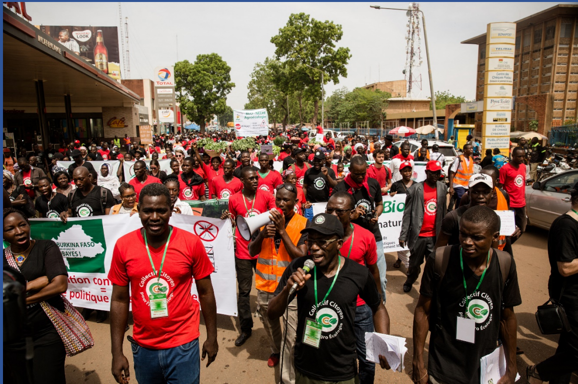
March against Target Malaria, Burkina Faso, 2019

Gene drive is a new technology that causes the extermination of the entire species and it is this operation of extermination which is aimed at the Anopheles gambiae species which, according to Target Malaria, must be enabled to eliminate malaria. The populations are neither informed of the third phase of the project, nor of the technology of species extermination that will be used. Moreover, the Anopheles gambiae is not the only mosquito species that transmits malaria in Burkina Faso 6 , there are others, such as Anopheles arabiensis and Anopheles funestus . The impact of the removal of one among several mosquito species is uncertain.