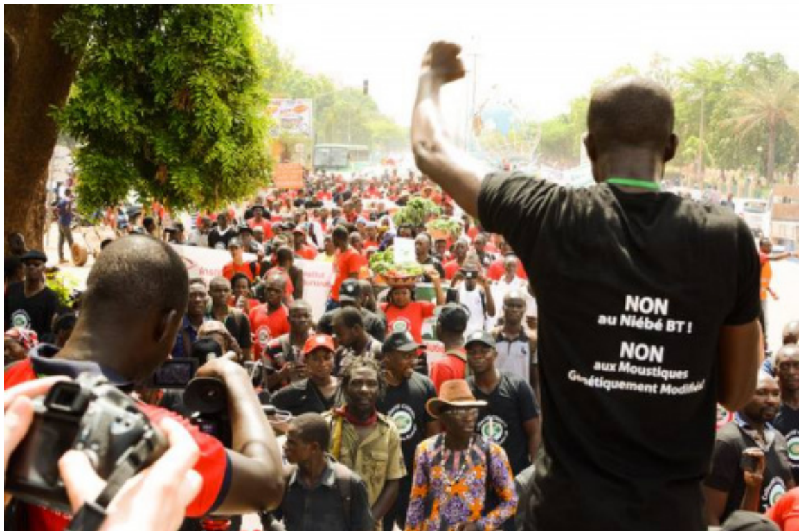
Protest in Burkina Faso, June 2018.