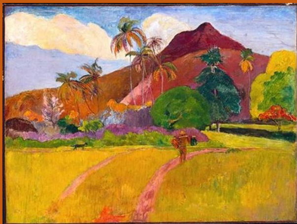
Paul Gauguin, (Tahitian Landscape), 1891