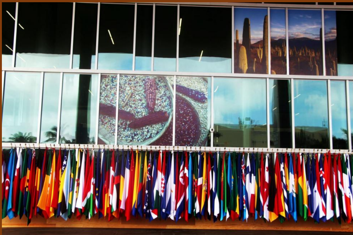
COP13 - Convention on Biological Diversity.

Gates, and his push to digitalise every aspect of life, undermines the CBD and the FAO Seed Treaty through Digital Sequence Information (DSI) 5 and patents based on digital genome mapping.