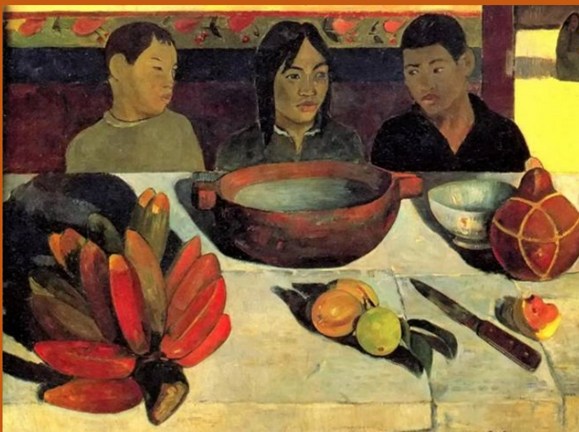
Paul Gauguin, Le Repas (The Meal) , 1891