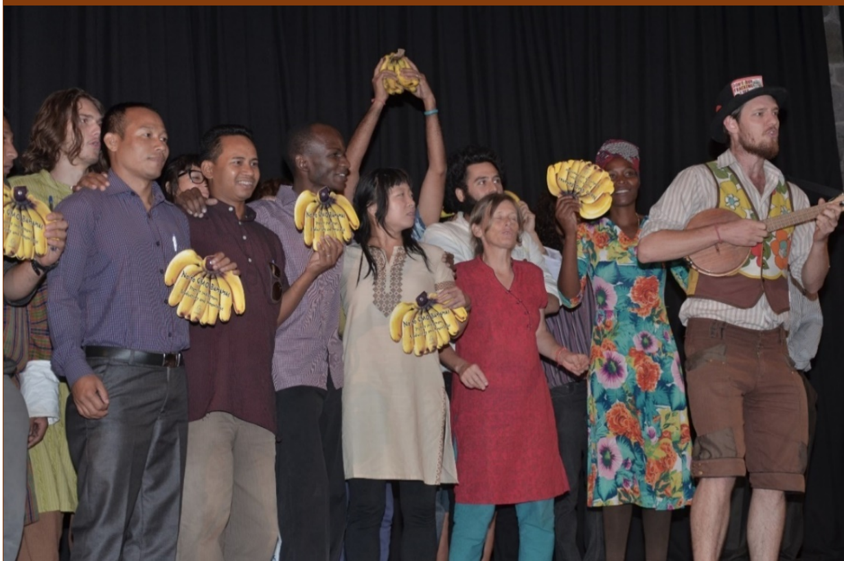
No GMO Banana Campaign – Navdanya / Seed Freedom, 2014

In addition to succeeding in stopping the Gates GMO banana from being imposed on India, these international campaigns against GMO Bananas 8 served to connect the issues of GMOs, Biopiracy, and the ethical violations of human trials by connecting movements in Asia, Africa, Australia and the US. It helped expose the colonialist mindset behind the project and the multiple human rights issues connected with it. The campaign also showed the absurdity of GMO bananas when there are so many more effective solutions to issues of nutritional and iron deficiencies