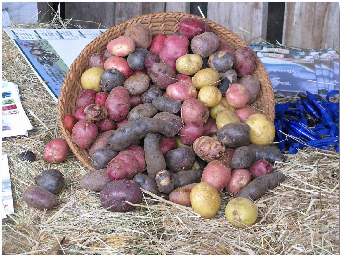
"A selection of Chiloé's roughly 400 native varieties of potatoes".

The Treaty is also crucial because of inter-country interdependence. For example, what happened in Ireland in the 1940s, when potato crops, which was the national staple food, were attacked by a fungus, the Phytophthora infestans . The famine that followed is considered one of the greatest catastrophes in European history as it caused the death of some two million people. But what was the underlying problem? Why was it impossible to cope with the disease? The answer is simple and brings us back to the dangerous concept of uniformity: at the end of the 1500s, a handful of uniform varieties of potatoes were introduced into Ireland. And it is because of that uniformity that the Phytophthora fungus was able to spread easily. The conquistadors had only brought that one variety. At that point, how could this problem that threatened the rest of Europe be solved? European agronomists had to return to Latin America, and precisely to Peru, to find other diverse resistant varieties to eradicate the disease. But this is not an old story.