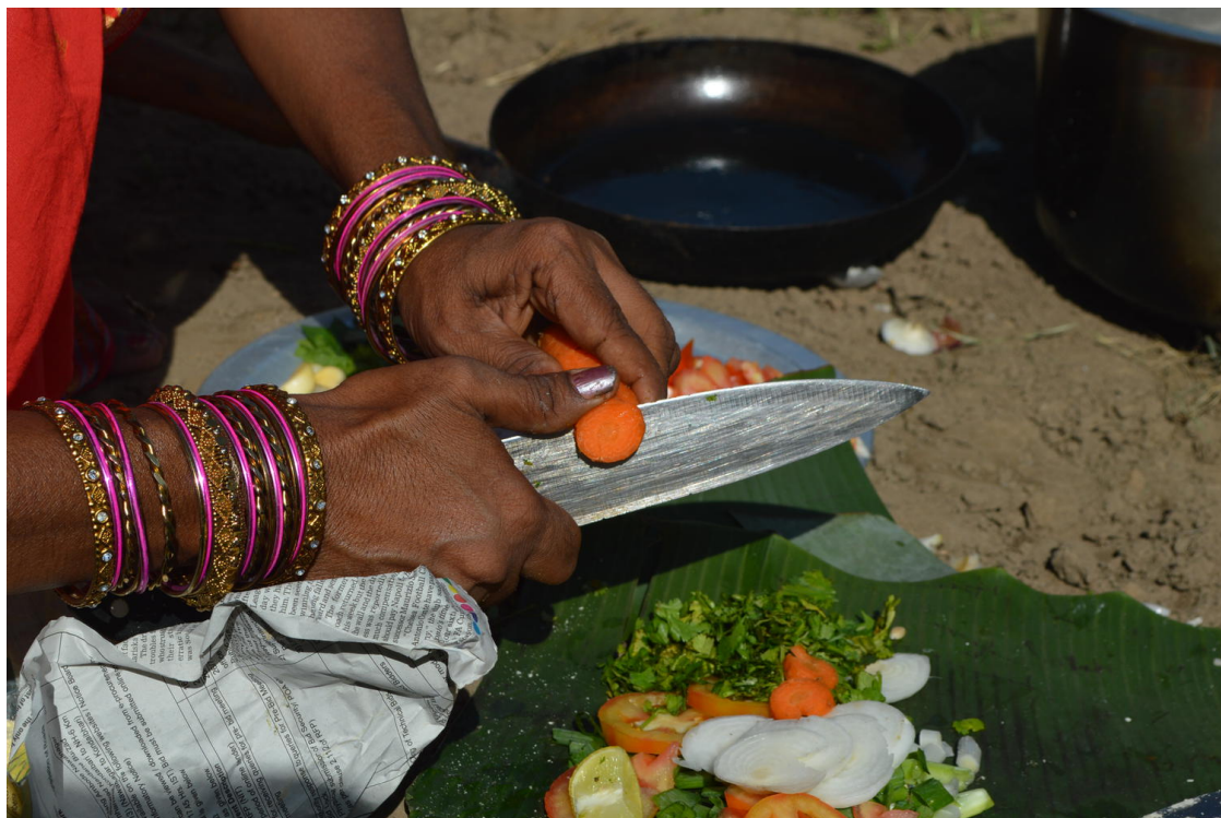
Biodiversity Festival at Navdanya, 2018

Oblivious of the clearly growing shift to agroecology and organic food with more and more communities creating local, diversity-based, ecological, systems of growing food, the Poison Cartel continues to manipulate and promote new industrially- based markets.