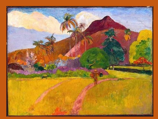
Paul Gauguin, (Tahitian Landscape), 1891