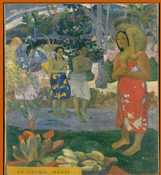
Paul Gauguin, La Orana Maria (The Virgin Mary), 1891

In the early 2000's US researcher Lois Englberger, living in Micronesia, after searching for sources of vitamin A in the traditional diet of Micronesia, found that Micronesian 'Karat' bananas – so called because of their orange 'carrot-like' flesh and subsequent high beta-carotene content - had been traditionally used in Micronesia as an infant weaning food<sup>2</sup>.