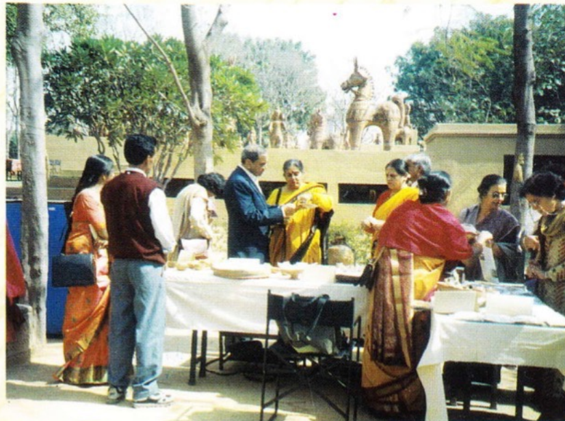
BRINGING MILLET BACK: DWD's Forgotten Foods organic lunch brought nostalgic memories of grandmother's millet and amaranth based recipes.

DWD celebrated the Basmati Victory – the revocation of the broadbased patent claims of RiceTec Inc. by the USPTO with a rice dinner. Over 20 rice dishes from various parts of India gave an insight to participants of the role of cultural diversity in food.