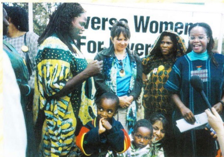
Children plant the Neem tree with Diverse Women at Nairobi to reaffirm their nurturing relationship with the Earth